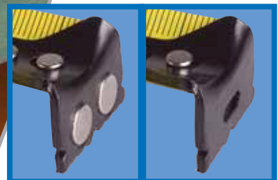
magnetic or gripper hook available

A comprehensive range of measuring tapes covering lengths up to 100m. The range includes 2m, 3m, 3.5m, 5m, 10m, 15m, 30m, 50m and 100m measuring tapes including open reel, closed reel, fibreglass, and nylon coated steel.